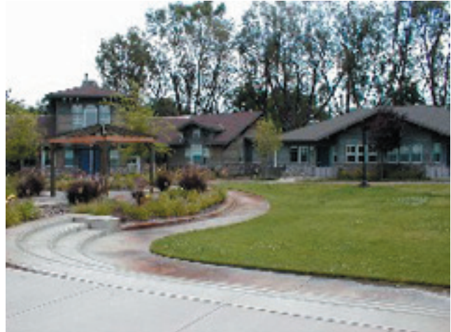
The Ronald McDonald House

SAM 72 has been offered a new meeting location that is closer to downtown Sacramento and conveniently located near two freeways. It is the Ronald McDonald